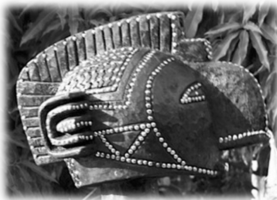
D'mba Mask, symbol of Guinea National Pride